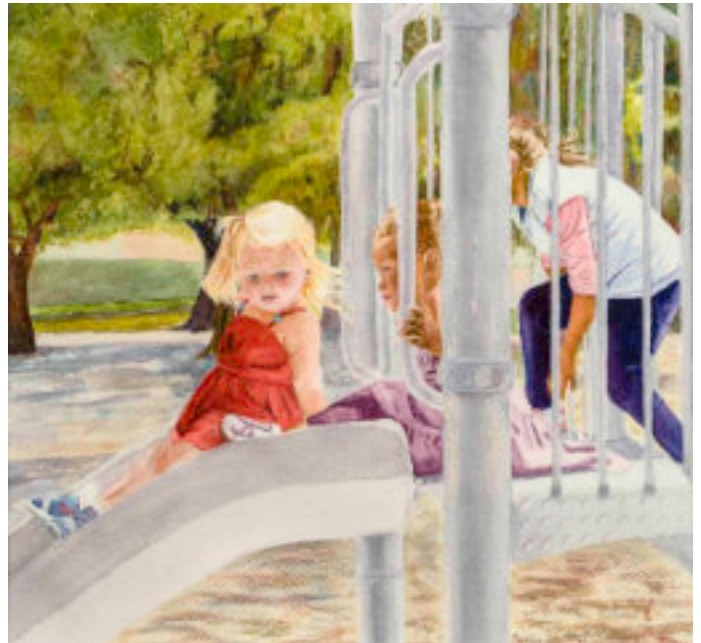
My Turn Watercolor by Carrie Drilling SWA