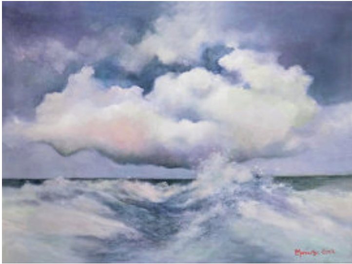
Cloudy Day Watercolor by Leona Moriarty SWA