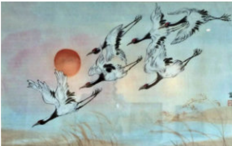
White Cranes Flying Watercolor by Lillian Wu SWA