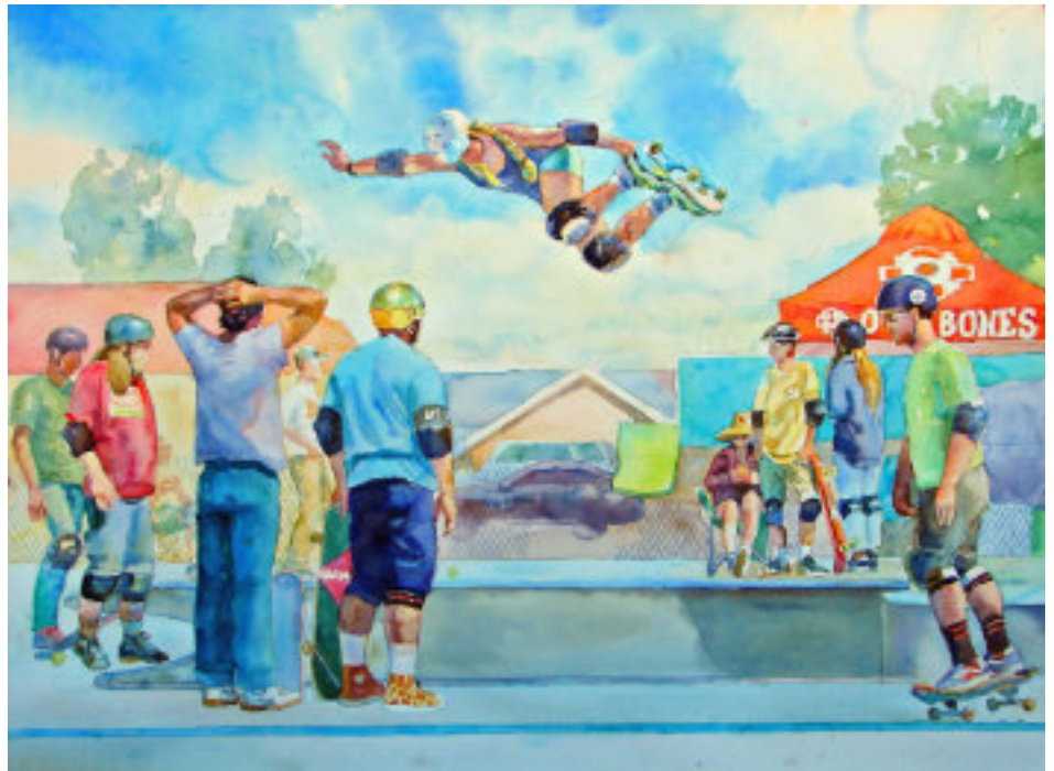
Up in the Air Watercolor by Dmitry Grudsky SWA