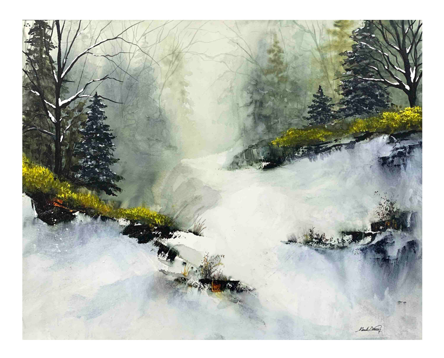
1<sup>st</sup> Place Washed in White Watercolor and Gouache by Mark Dobrin