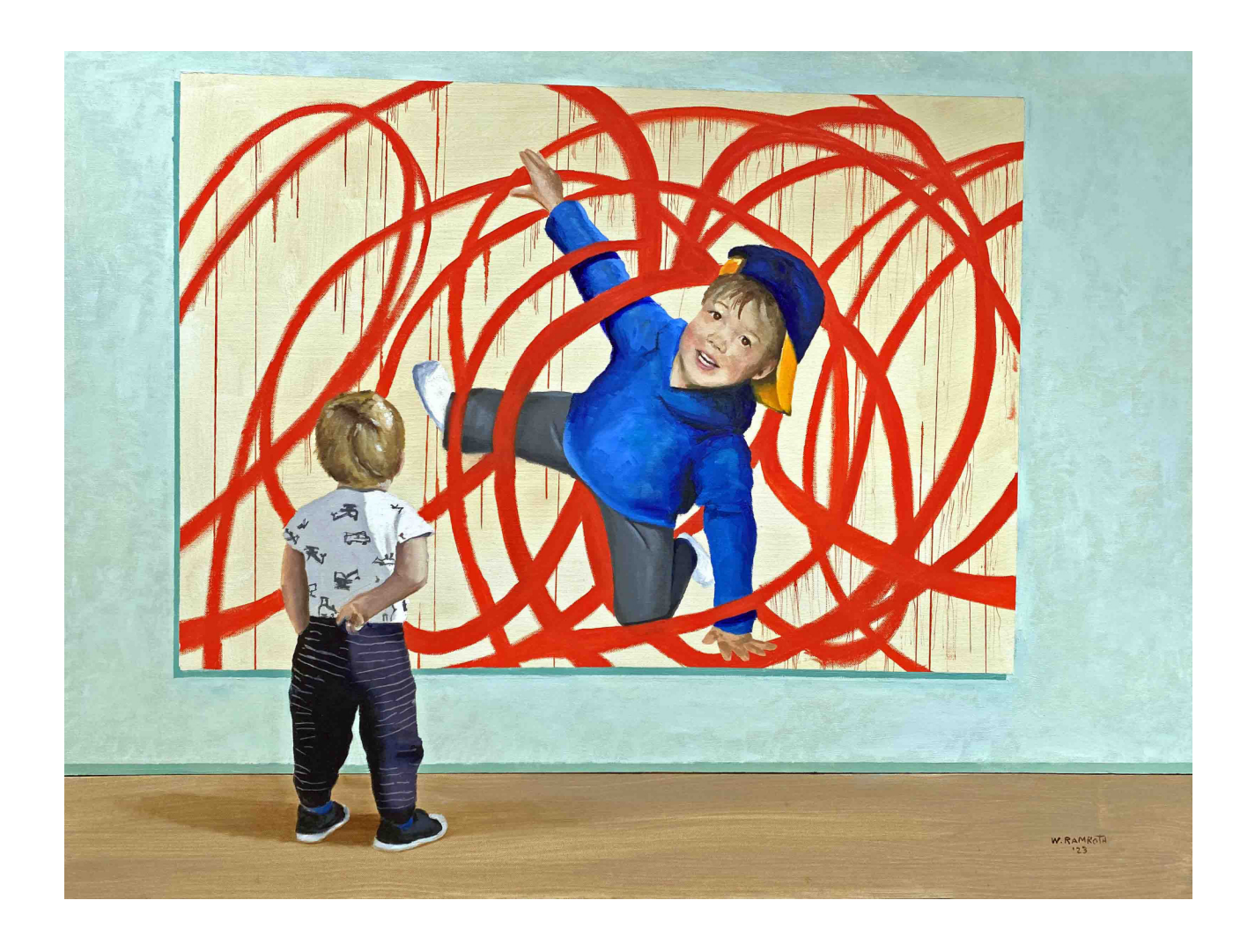
2<sup>nd</sup> Place Tangled in a Twombly at the Tate Oil by Bill Ramroth SWA