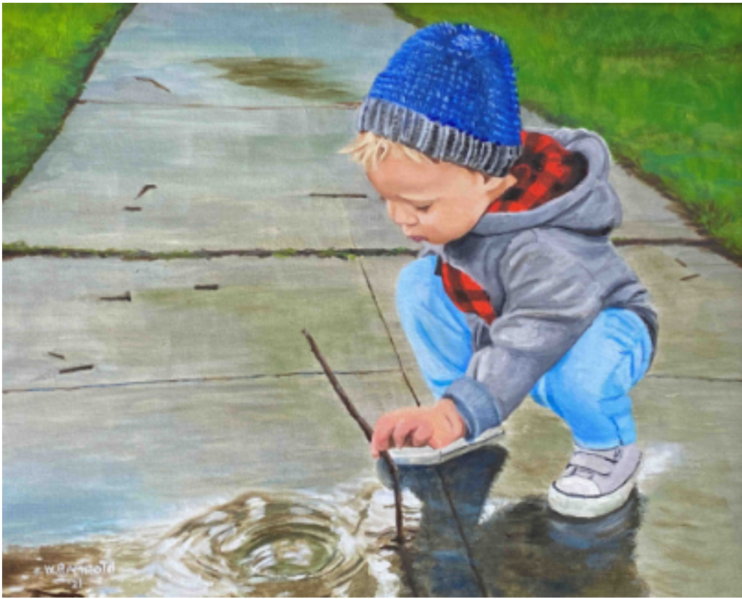
2nd Place The Puddle Oil by William Ramroth