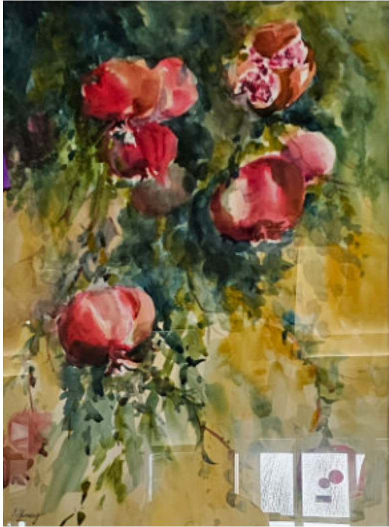
Best of Show Pomegranates Watercolor by Kikuko Young