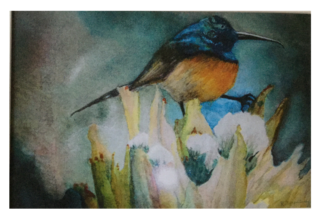
Honorable Mention Golden Bird of South Africa Watercolor by Rose Nieponice