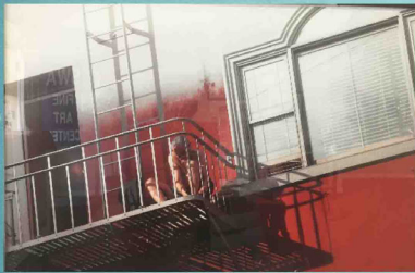
1st Place - Photography "A Day on Haight Street" Zaw Khant

Funded by a grant from the San Bruno Community Foundation