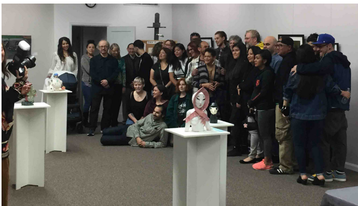
Skyline College Show Reception

SWA has received a grant from the San Bruno Community Foundation to host Skyline again next year.