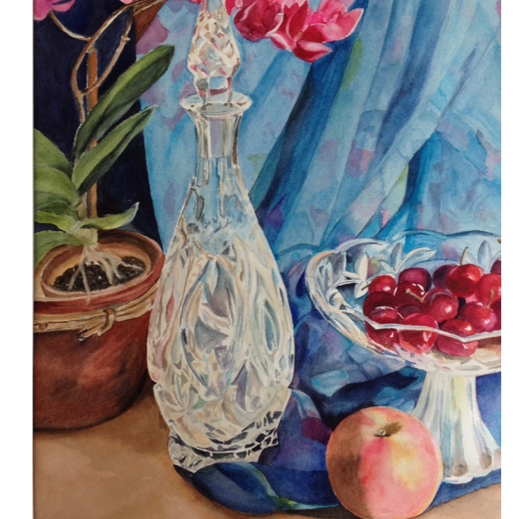
3rd Place Crystal Decanter Watercolor by Lynn Flodin